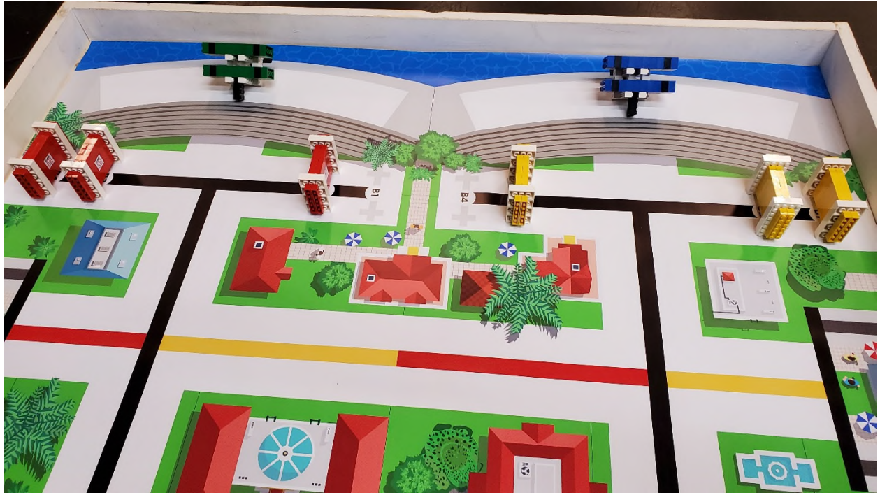
Position of the racks, the sandbags and concrete blocks