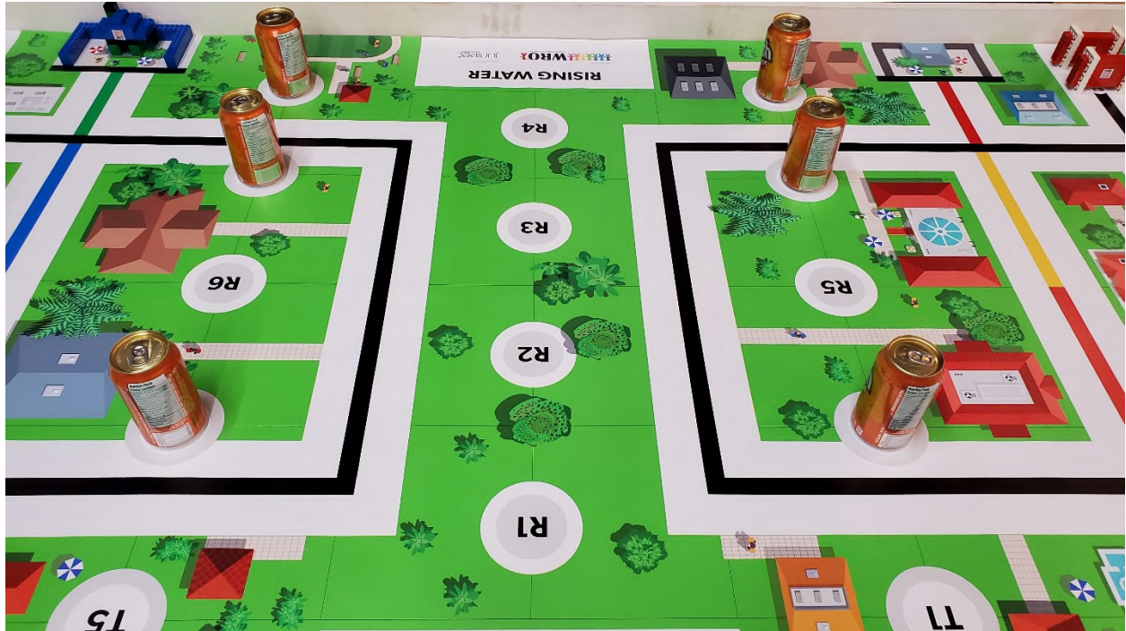
Position of the 6 trees